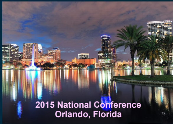
2015 National Conference Orlando, Florida

Email: info@naaaea.org Website: http://www.naaaea.org